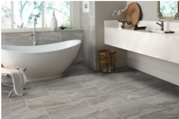
Cliffside Grey - RV93 Metropolitan Grout - D195