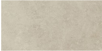
Tuscan Beige - RV97 Whisper Beige Grout - D189