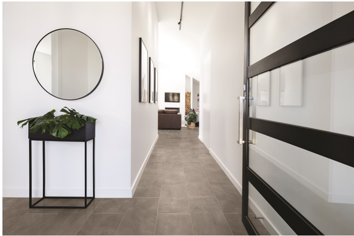
Power Grey - RV90 Grey Mist Grout - D198