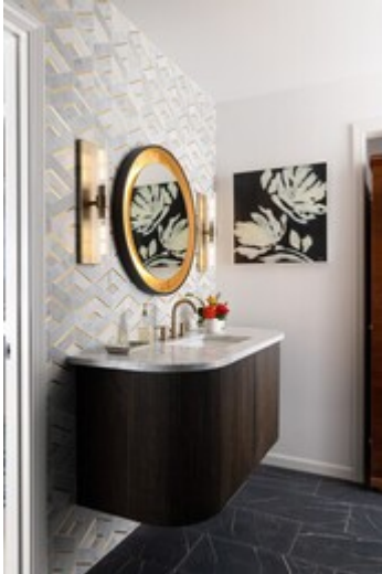
Midnight Black - RV99 Metropolitan Grout - D195