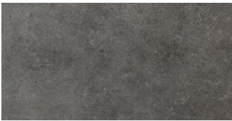
Anchor Black - RV98 Metropolitan Grout - D195