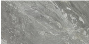
Luna Grey - RV92 Grey Mist Grout - D198